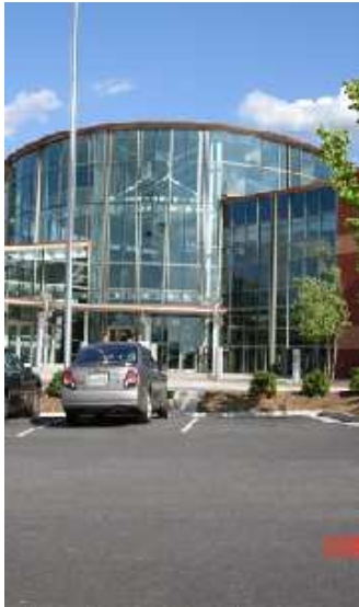
Institute for Advanced Learning and Research, Danville: Southern Virginia Session, May 2006