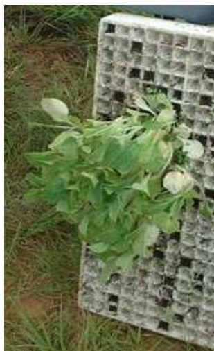
Tobacco ready for planting at Maxey Farms - May 2006 Southern Virginia session

drew to a close, participants offered appreciation for a deeper "understanding the interests, concerns and heart of the region" and expressed a heartfelt "Thank you for giving us a window to the soul of Southside VA!"